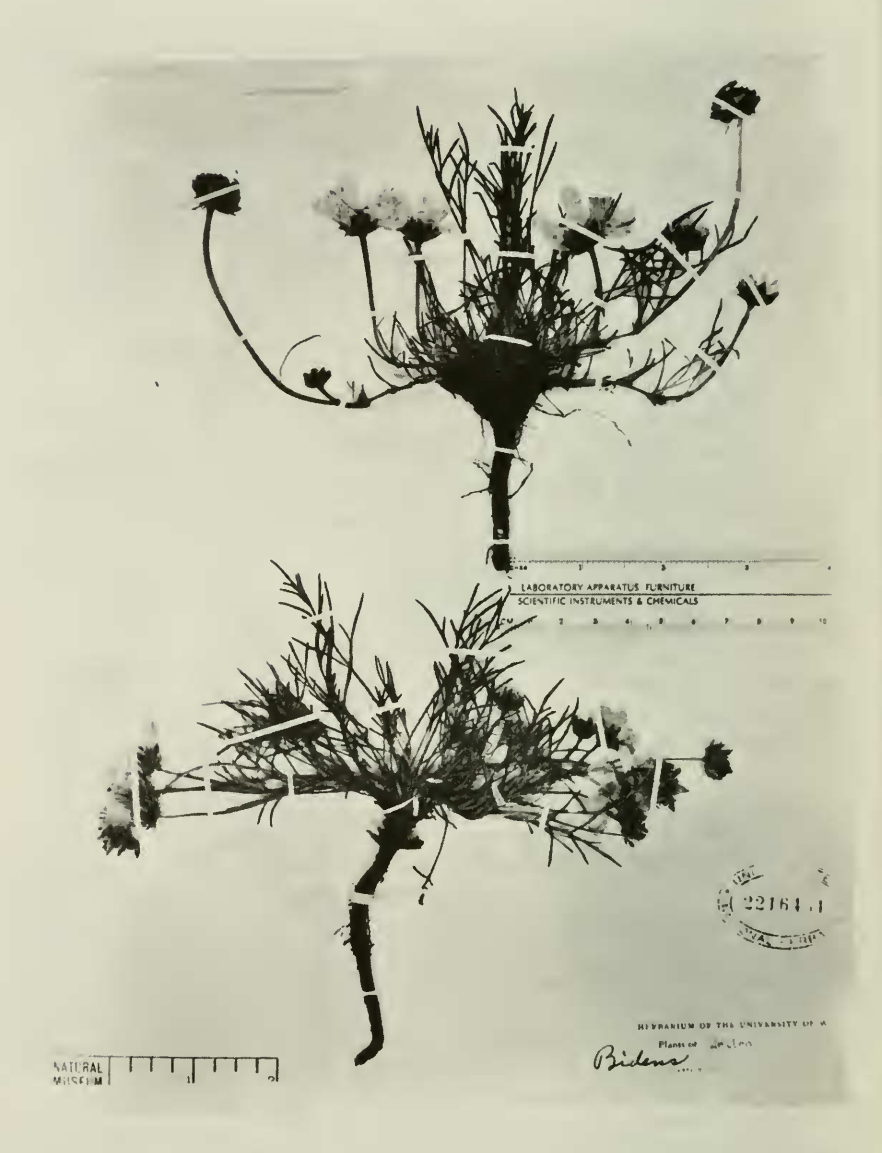
Figure 2. Herbarium specimen of Thelesperma graminiformis, Stanford, Lauber, & Taylor 2510 (US).